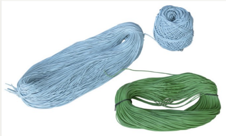
skeins or balls